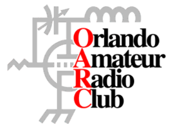
Hamcation 2010 is sponsored by the Orlando Amateur Radio Club