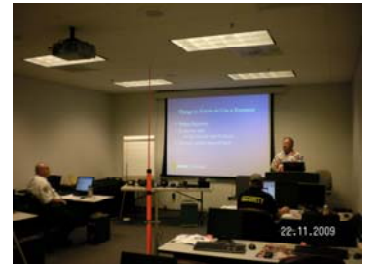
dents at our next training event. I even expect 2 new HAMs next Wednesday night